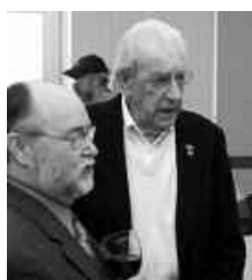
Candid shots from the luncheon.